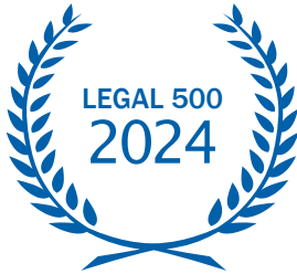
Trade Mark Attorneys Tier 2 Ranking for Technology, Media and Telecoms Legal 500