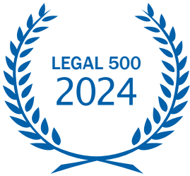
Patent Attorneys Tier 2 Ranking for Technology, Media and Telecoms Legal 500