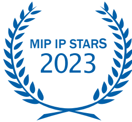
Maucher Jenkins Leading UK Intellectual Property Firm MIP IP Stars